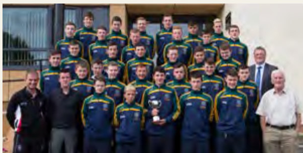
Junior Boys' Gaelic Football Team, Connaught Champions 2014.