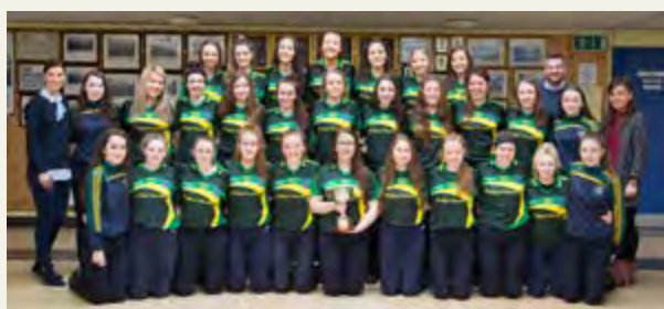
Senior girls gaelic team, County Champions 2017-18.