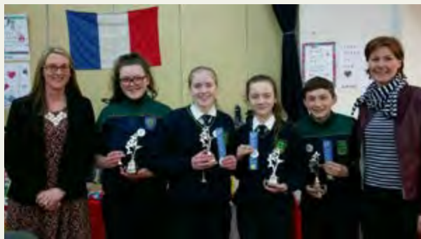
Regional French Quiz winners 2018, 2nd place.

Involvement in drama, quizzes, music and public speaking is encouraged also. We have featured prominently in the Mental Health Assoc.