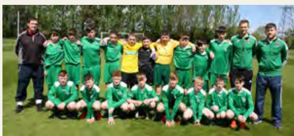
1 st year Soccer Team 2017-18 All Ireland finalists.