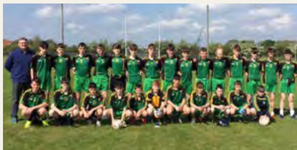
Juvenile Boys' Gaelic Football Team, Connaught Champions 2017.