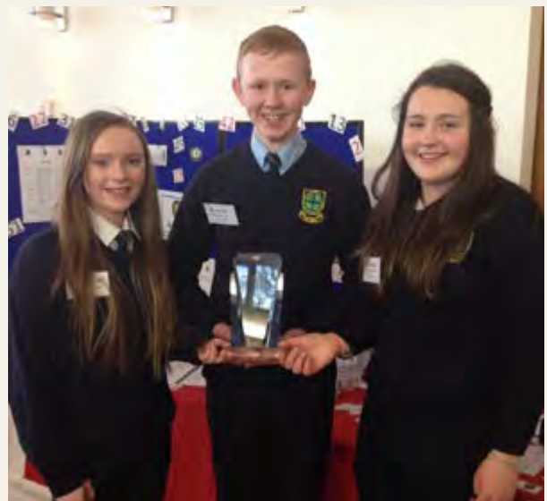
Enterprise Competition winners senior category 2014-15.