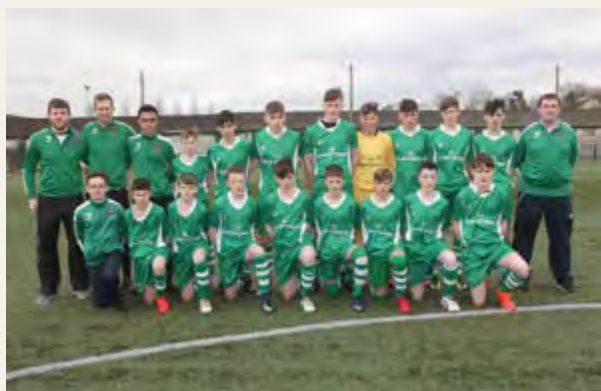
All Ireland Under 15 Soccer finalists 2017-2018.

Public Speaking Competitions, reaching regional finals on several occasions. Our senior girls have participated in the Business and Professional Women's Association public speaking competition with great success over the past few years, reaching the All Ireland Finals twice.