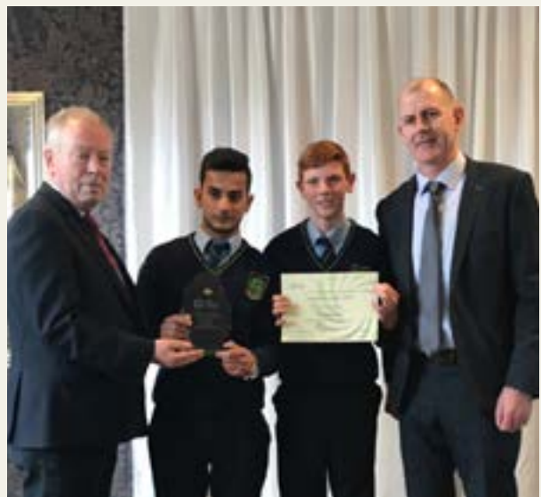
MSLETB Award winners 2018-2019.