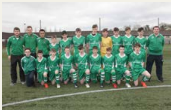
All Ireland Under 15 Soccer finalists 2017-2018.

Public Speaking Competitions, reaching regional finals on several occasions. Our senior girls have participated in the Business and Professional Women's Association public speaking competition with great success over the past few years, reaching the All Ireland Finals twice.