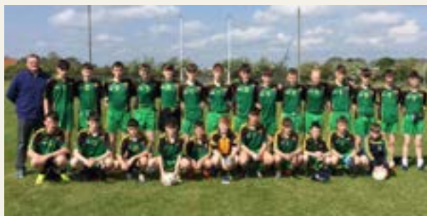
Juvenile Boys' Gaelic Football Team, Connaught Champions 2017.