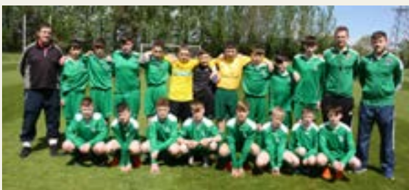
1 st year Soccer Team 2017-18 All Ireland finalists.