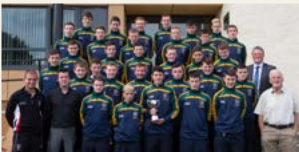
Junior Boys' Gaelic Football Team, Connaught Champions 2014.