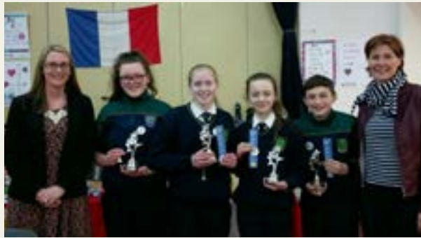
Regional French Quiz winners 2018, 2nd place.

Involvement in drama, quizzes, music and public speaking is encouraged also. We have featured prominently in the Mental Health Assoc.