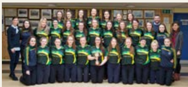
Senior girls gaelic team, County Champions 2017-18.