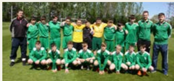
1 st year Soccer Team 2017-18 All Ireland finalists.