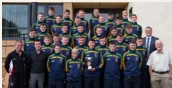
Junior Boys' Gaelic Football Team, Connaught Champions 2014.