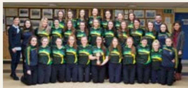
Senior girls gaelic team, County Champions 2017-18.