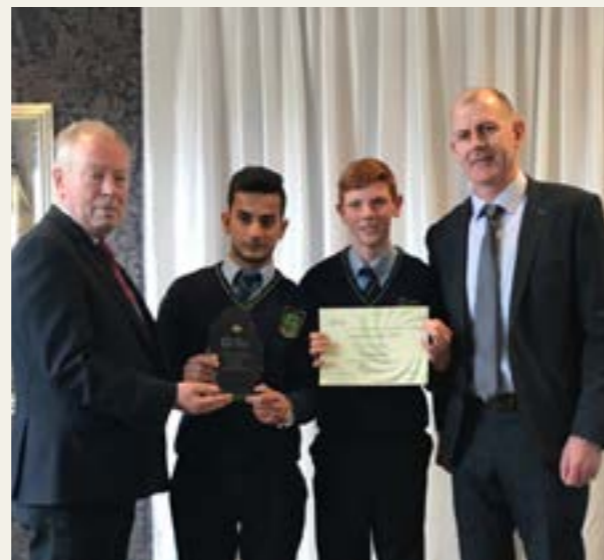
MSLETB Award winners 2018-2019.