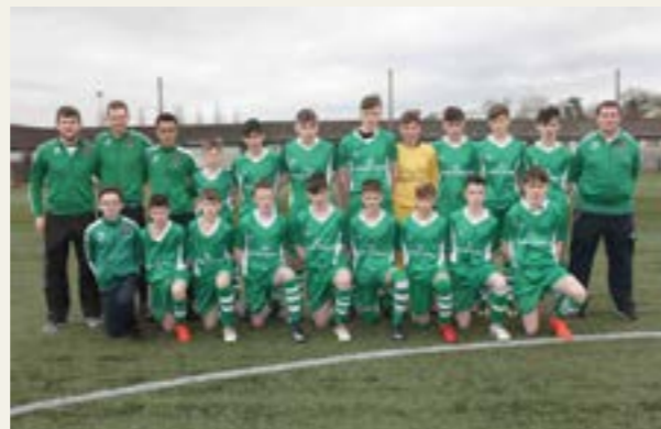
All Ireland Under 15 Soccer finalists 2017-2018.

Public Speaking Competitions, reaching regional finals on several occasions. Our senior girls have participated in the Business and Professional Women's Association public speaking competition with great success over the past few years, reaching the All Ireland Finals twice.