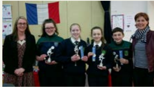
Regional French Quiz winners 2018, 2nd place.

Involvement in drama, quizzes, music and public speaking is encouraged also. We have featured prominently in the Mental Health Assoc.