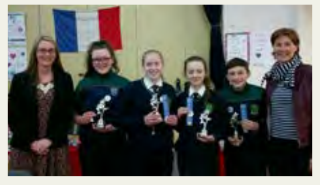
Regional French Quiz winners 2018, 2nd place.

Involvement in drama, quizzes, music and public speaking is encouraged also. In the past we featured prominently in the Mental Health Assoc.