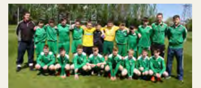
1<sup>st</sup> year Soccer Team 2017-18 All Ireland finalists.