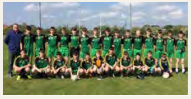
Juvenile Boys' Gaelic Football Team, Connaught Champions 2017.