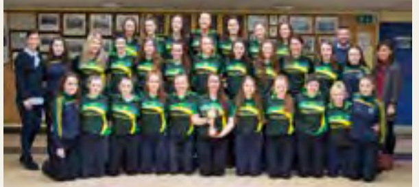
Senior girls gaelic team, County Champions 2017-18.