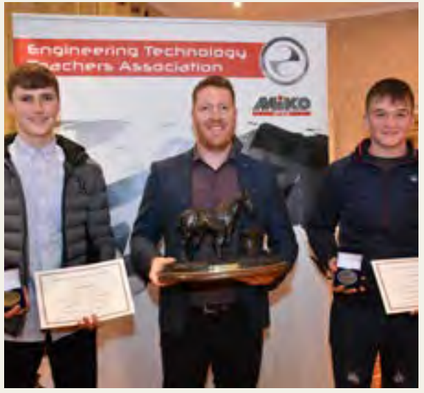
1st and 2nd placed regional winners in the Higher level Leaving Cert 2021 Engineering Projects competition.