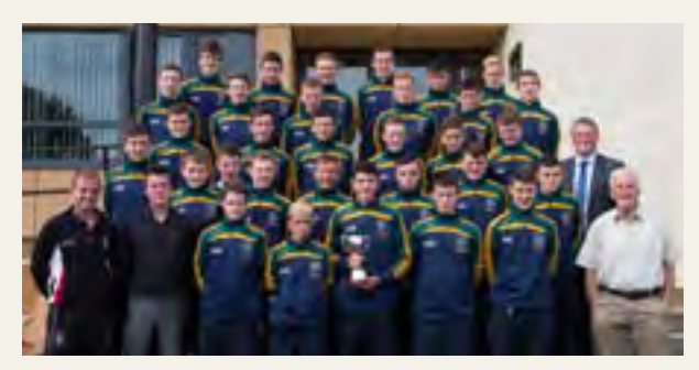
Junior Boys' Gaelic Football Team, Connaught Champions 2014.