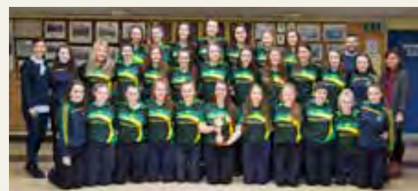
Senior girls gaelic team, County Champions 2017-18.