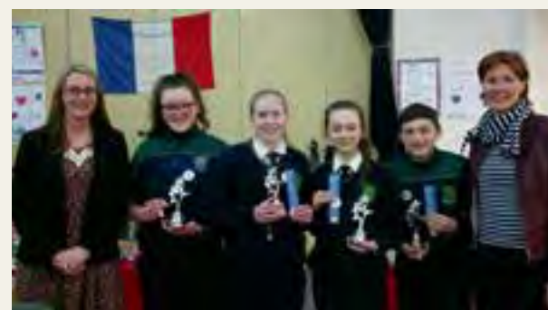
Regional French Quiz winners 2018, 2nd place.