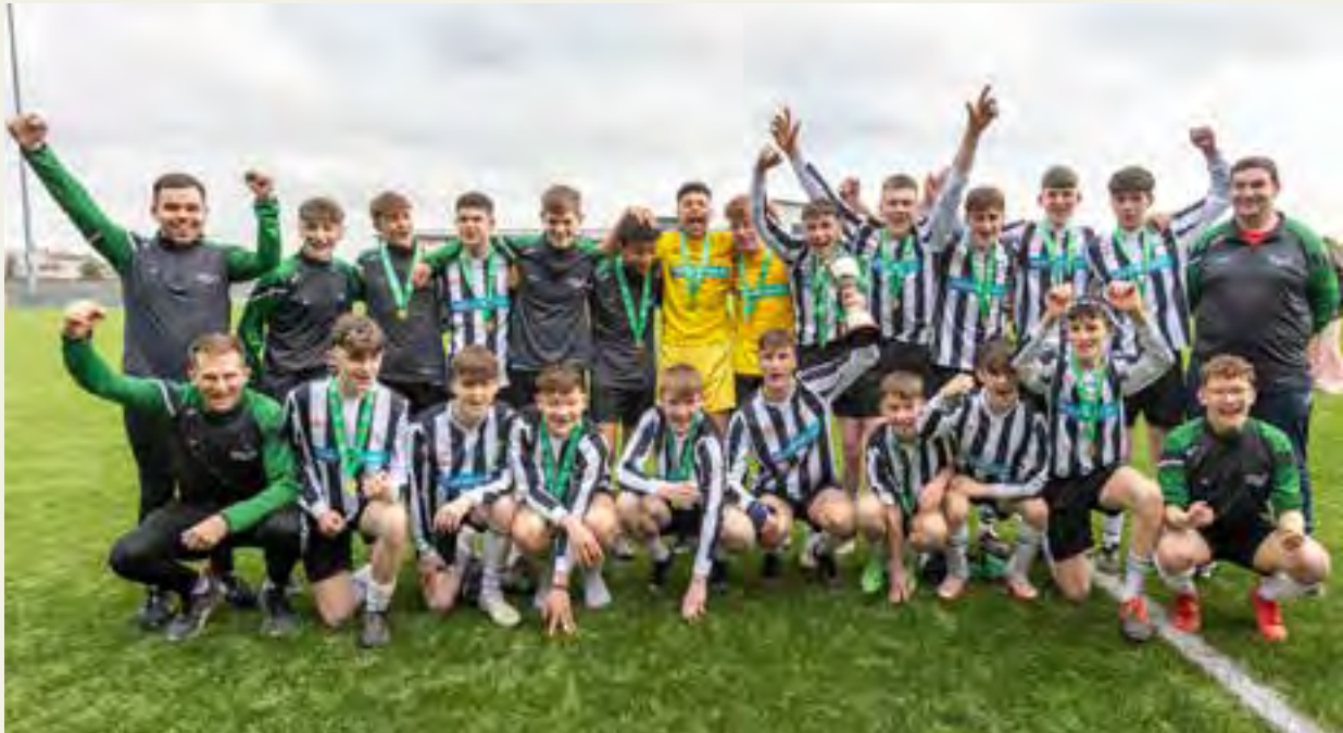
U17 Boys Soccer All Ireland Champions 2022.