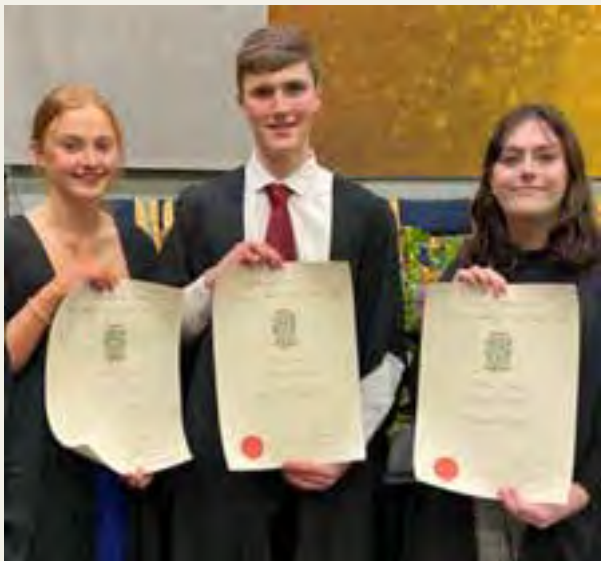
UCD Entrance Scholarship Recipients 2021.