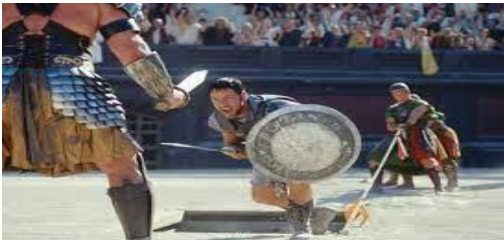
First Years study Ancient Roman Civilisation.

In Coola, we endeavour to instil students with an interest in, and love for, History, whether you are learning about the backgrounds and daily lives of Gladiators in Ancient Rome in First Year, are in TY investigating the various conspiracies surrounding the assassination of JFK, or are studying the dark history of the Troubles in Northern Ireland for Leaving Cert.