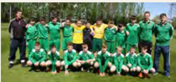
1 st year Soccer Team 2017-18 All Ireland finalists.