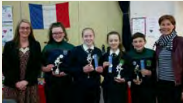
Regional French Quiz winners 2018, 2nd place.

We encourage our students to use their free time positively through participation in extra-curricular activities. These activities make an important contribution to the overall learning and maturation process in any school.