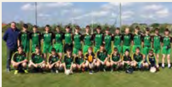
Juvenile Boys' Gaelic Football Team, Connaught Champions 2017.