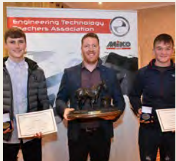
1st and 2nd placed regional winners in the Higher level Leaving Cert 2021 Engineering Projects competition.