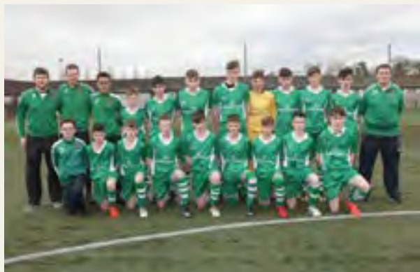
All Ireland Under 15 Soccer finalists 2017-2018.

Public Speaking Competitions, reaching regional finals on several occasions. Our senior girls have participated in the Business and Professional Women's Association public speaking competition with great success over the past few years, reaching the All Ireland Finals twice.