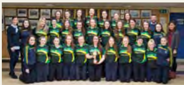
Senior girls gaelic team, County Champions 2017-18.