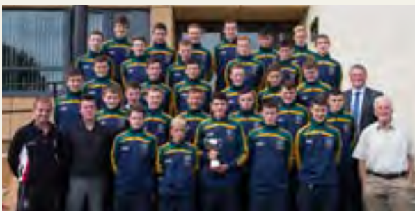
Junior Boys' Gaelic Football Team, Connaught Champions 2014.