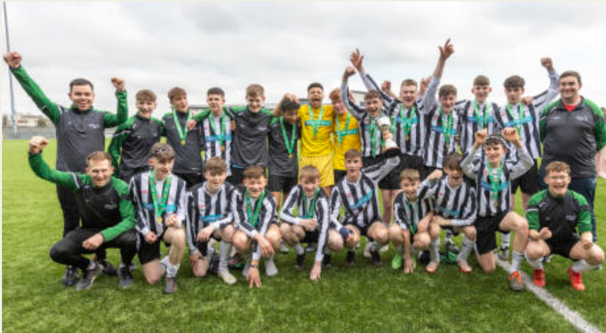
U17 Boys Soccer All Ireland Champions 2022.