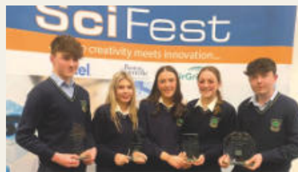
Scifest winners 2023.

Involvement in drama, quizzes, music and public speaking is encouraged also. In the past we featured prominently in the Mental Health Assoc. Public Speaking Competitions, reaching regional finals on several occasions. Our senior girls have participated in the Business and Professional Women's Association public speaking competition with great success over the past few years, reaching the All Ireland Finals twice.