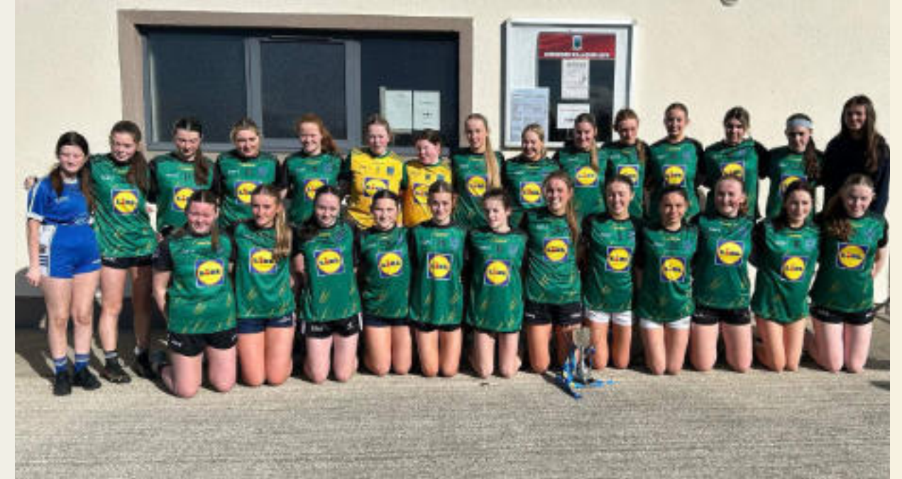
Senior Girls Gaelic Connaught Champions 2025