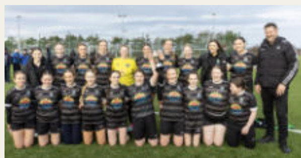
U20 Girls Soccer Connaught Champions 2025.